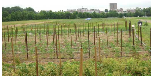
Research fields at the Beltsville Agricultural Research Center. For more tour information, see www.loudounfarms.org .

Participants in the tour will see historic buildings, barns, and silos, and receive information on center research to protect the environment, provide wholesome and safe food supplies, and improve agricultural fibers. The $25 registration fee includes transportation, snacks, and lunch. A few spots are still available, for more information call 703-777-0426.