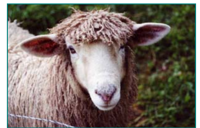
Willow Hawk Farm will offer a chance to view their animals, enjoy hayrides, and purchase their pesticide, hormone, and antibiotic-free lamb.