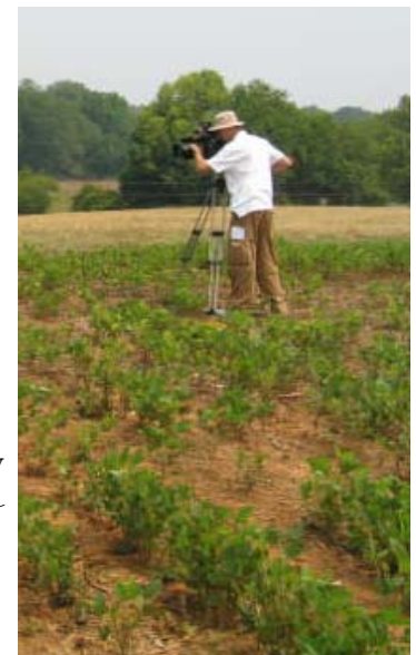
In a typical year, the soybean plants surrounding the Fox 5 cameraman would have been as tall as his knees.

"Buying local food and products from Loudoun farmers will be the best community assistance," said Gary. "But please remember the products may not be as big and plentiful as usual."