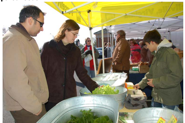
Endless Summer Harvest from Purcellville sells its organic lettuces at the market each Saturday.

For a listing of vendors and more information on the winter farmers market, visit www.LoudounFarms.org .