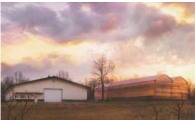
Endless Summer Harvest's greenhouse facilities