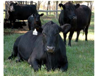
Loudoun's most valuable agricultural product for 2006 – 27,000 head of cattle – contributed an estimated $27 million in sales to the agricultural economy.

◆ The latest information from the Virginia Agriculture Statistics Bulletin & Resource Directory shows that Loudoun continues to be a state leader in both grape and hay production. According to figures released this fall, Loudoun leads all other Virginia counties in hay production, at more than 377,000 tons in 2005. Loudoun also ranks second in the state (behind Albermarle County) for its production of 709 tons of grapes, and its more than 250 grape bearing acres. The total value of Loudoun's agricultural economy, including crops, animals, horticulture, grapes & wines is currently estimated at $55 million, a 116% percent increase since 1997.