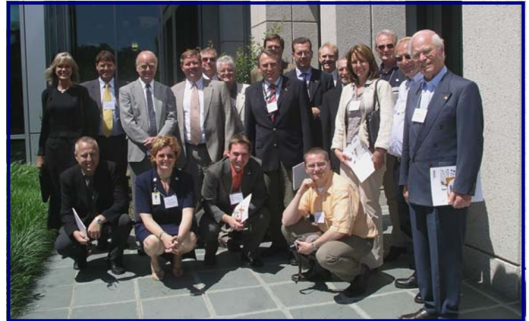
The delegation, escorted by Loudoun representatives, met with the senior executives of German-based Rehau at their Leesburg facility.

Loudoun County put some of its best business and cultural assets on display for a delegation of eleven elected officials, school representatives, and other economic development leaders from the Main-Taunus-Kreis (MTK) region near Frankfurt, Germany June 14-17. The group, which had hosted Loudoun lead-