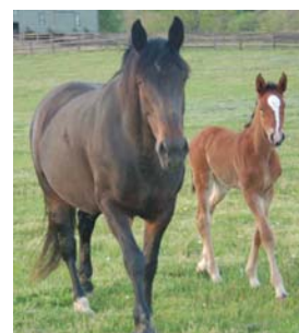
Kilronan's Irish Draught horses.