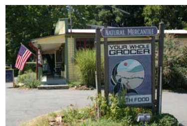
The Natural Mercantile in Hamilton.