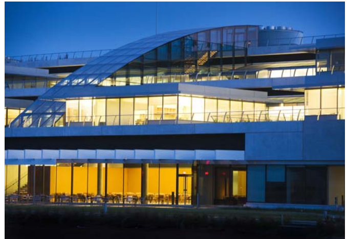
A view of HHMI's three-story Landscape Building at sunset. Although larger than the main terminal at Dulles Airport, the building was constructed in line with the topography and is not visible from nearby Route 7.

Although technically an event for the October edition of LoCo Motion, DED couldn't allow the grand opening of the Howard Hughes Medical Institute Janelia Farm Research Campus go unmentioned. A series of galas, business receptions, and public open house events will be held the first week of October. Those attending the earliest events declared the facility and its staff "inspiring." More details will follow next month.