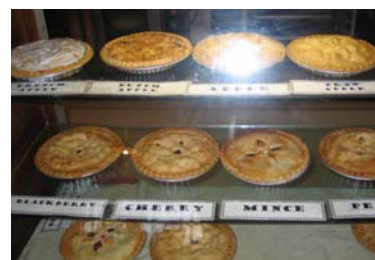
Just a few of Hill High's 37 kinds of pie baked daily.