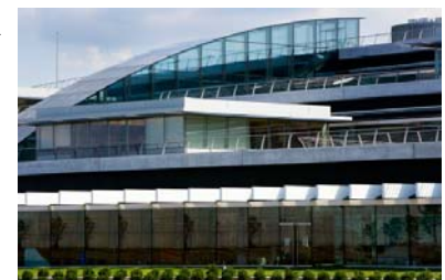
Janelia Farm's main research building