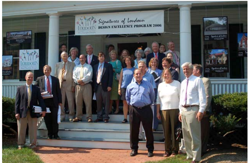
Representatives for the 2006 "Signatures of Loudoun" Design Awards gather at the Burnett & Williams Law firm in Leesburg, where images of the winners were displayed in July.