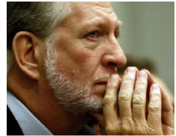
Gone but not forgotten in Loudoun, Bernie Ebbers filed papers September 29 to appeal his fraud and conspiracy conviction.

In other MCI news, lawyers for former MCI WorldCom CEO Bernie Ebbers have filed with the Second Circuit U.S. Court of Appeals in New York, stating that Ebbers was incorrectly convicted because the jury used a flawed execution of the “conscious avoidance” concept, which allowed them to declare him guilty based on knowledge of the wrongdoing in question. Ebbers was scheduled to begin a 25-year prison sentence October 12, but will remain free on bond pending the appeal.