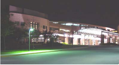
Inova Loudoun Hospital is in the process of a $200 million expansion and upgrade.