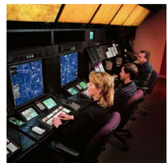
A Lockheed aircraft control center.

Lockheed is based in Bethesda, Maryland and employs 130,000 people worldwide.