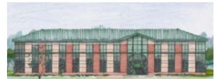
Lansdowne Office Park Phase II