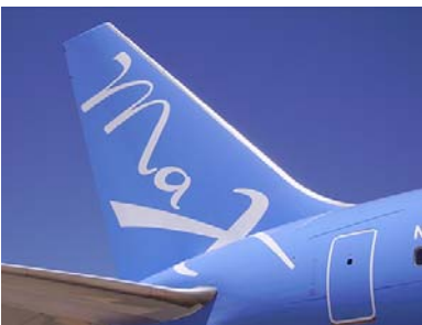
MAXjet says it will unveil a "revolutionary on-board product" later this year .