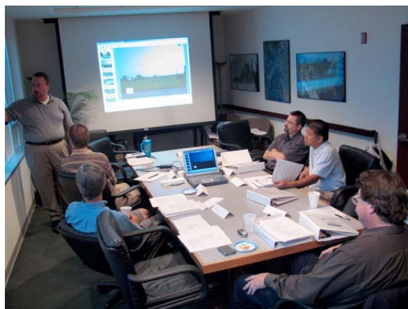
Members of the Loudoun County Design Cabinet review their plans for the Lovettsville Design Charrette, an open meeting for those interested in the merging of Lovettsville’s Town Center with its existing small town environment.

The purpose of the charrette is to listen to town residents express what they want to see in Lovettsville now and in the future, and develop ideas and suggestions for the upcoming town center that would be compatible and complimentary to Broad Way, the town’s existing main thoroughfare. The group will also request suggestions for the improvement of infrastructure along Broad Way, including sidewalks, power lines, and other street improvements.