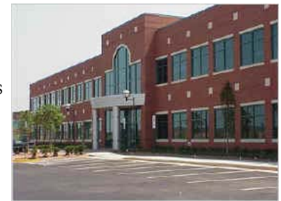
Mason at Loudoun is currently located at the Ridgetop II building at Loudoun Tech Center.