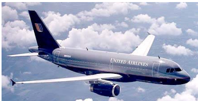
United improvements at Dulles are being designed to give passengers easier access to connecting flights, to customer service and check-in kiosks, and to the three United Red Carpet Clubs.