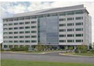
The new 185,000 square foot Dulles Town Center Building One at 21000 Atlantic Boulevard is the largest available block of Class A office space in Loudoun.