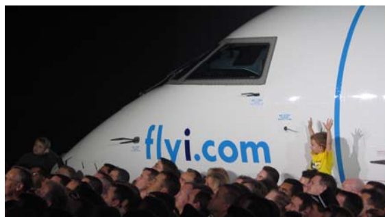
Enthusiasm was evident at the announcement of Independence Air unveiling.

and are actively moving forward with the launch of our new low-fare carrier. Our company will offer a product based on what today's consumers are demanding—low, simple fares, excellent service and convenient schedules featuring frequent departures and flexible tick-