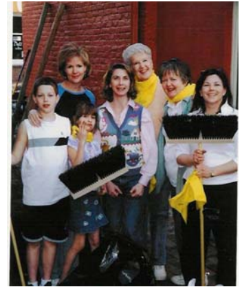
Pictured above and below are just some of the more than 110 volunteers who pitched in to clean up and beautify our communities during the Main Street is Blooming event. Great work!