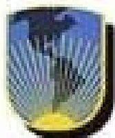
The Inter-American Development Bank will house its backup data center and office at the Beaumeade Corporate Center.

net.com develops and delivers service creation platforms for broadband, IP telephony, and multiservice networks. An architect of the networking industry, net.com has been supplying service providers, governments and enterprises around the world with bulletproof networking technology for more than 20 years. Its technology forms much of the backbone of today's multiservice network architecture.