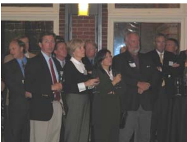
VIP Reception guests listen to the presentation of the EDC Education and Workforce Award.

views nominations, and selects the award winner.