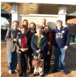
The county's Main Street Loudoun team studied examples of revitalization success during a recent trip.

1 Harrison Street, SE, 5th Floor P.O. Box 7000 Leesburg, Virginia 20177 Phone: 703-777-0426 Toll Free: 1-800-loudoun Fax: 703-771-5363