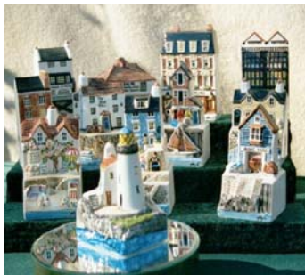
Hand painted ceramic houses from the United Kingdom are one of the specialty items at A Foggy Word.