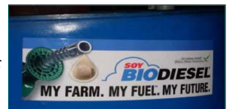
Biodiesel is just one of many topics scheduled for the Forum for Rural Innovation.