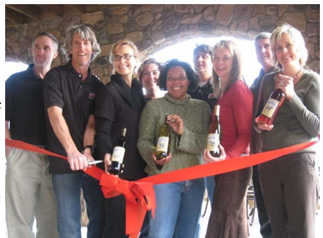
Bluemont Winery's owners state that their goal is to offer “a truly unique experience on the Virginia wine trail.”

In order to “raise your spirits while you, your friends, and or family enjoy our wine and hospitality,” Bluemont will offer a holiday open house each Saturday and Sunday through December 23. Tastings are available Fridays through Monday from 11 a.m. to 5 p.m., and private group tours and tastings are available by appointment.