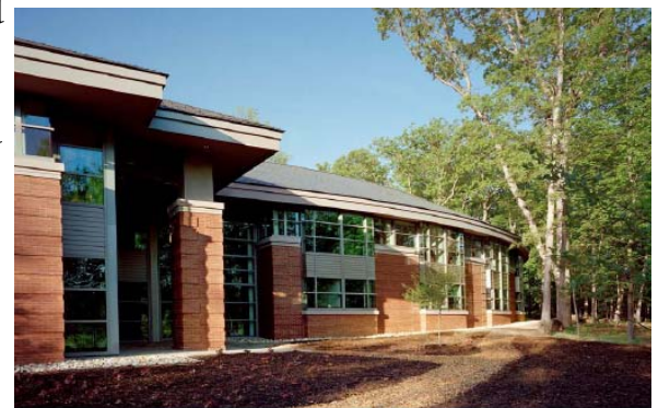
The Jack Kent Cooke Foundation building was recognized by NAIOP for its emphasis on natural light, its use of glass to capitalize on pastoral views, the preservation of large trees, and the variety of architectural elements, including the curvature of the building.